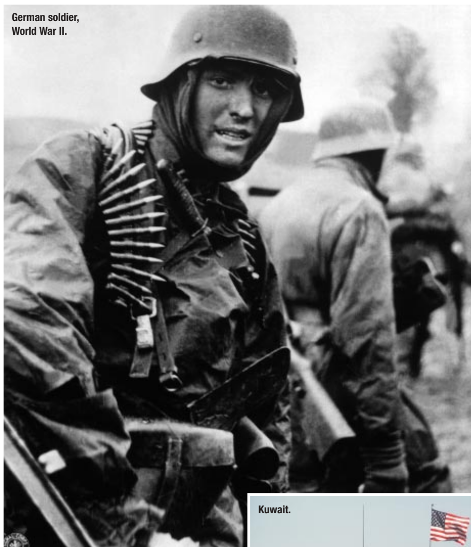
German soldier, World War II.